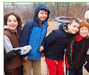
Manville "lower school" students play together after lunch.